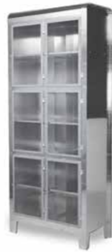
1092 PHILIPS CABINET 2-COLUMN