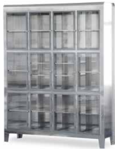
1093 PHILIPS CABINET 4-COLUMN