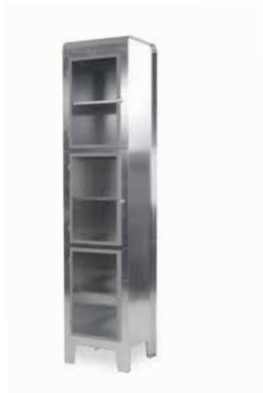
1091 PHILIPS CABINET 1-COLUMN