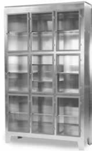
1090 PHILIPS CABINET 3-COLUMN