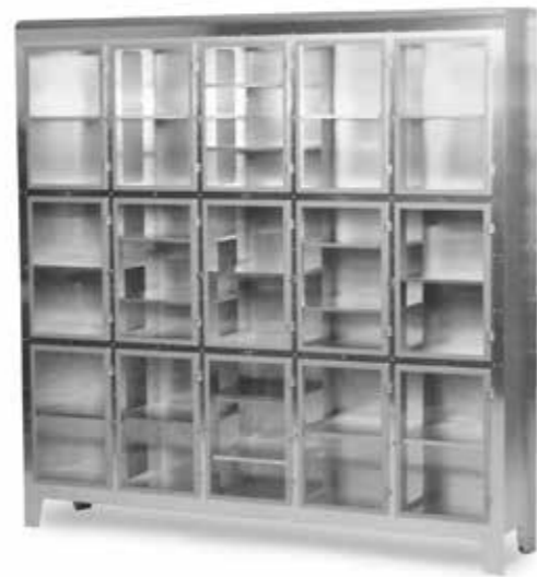
1094 PHILIPS CABINET 5-COLUMN