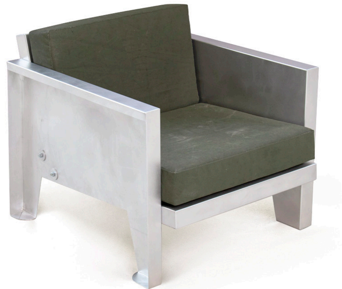
OUTDOOR ALUMINUM LOW SEAT