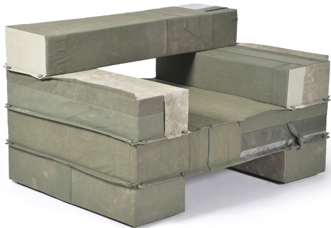
CHUNKY UPHOLSTERED BEAM ARMCHAIR