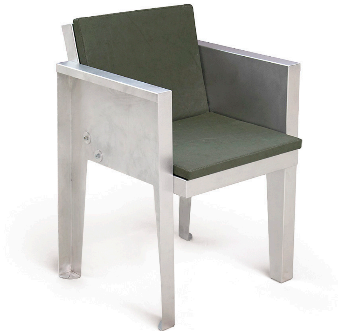
OUTDOOR ALUMINUM DINING CHAIR