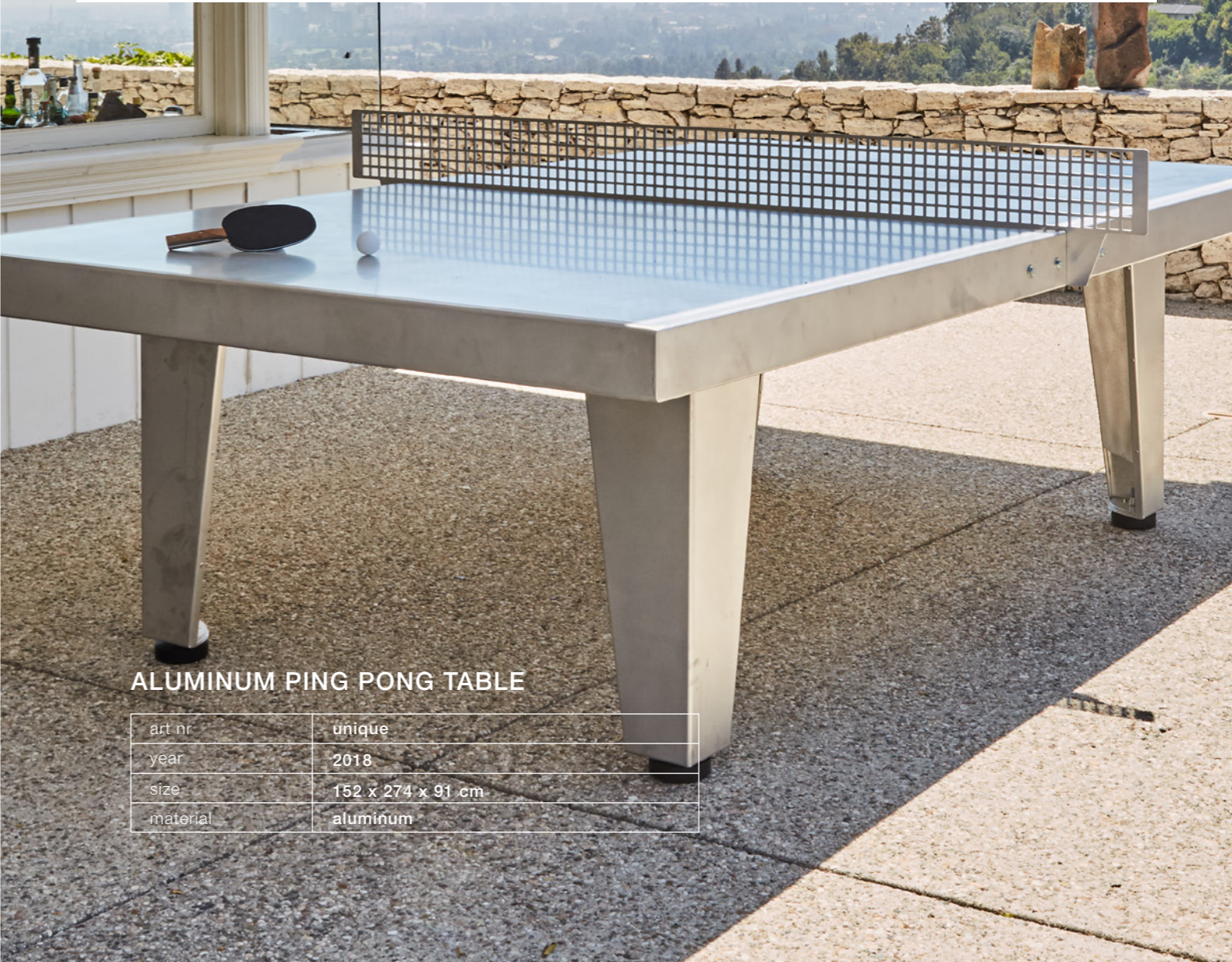
ALUMINUM PING PONG TABLE