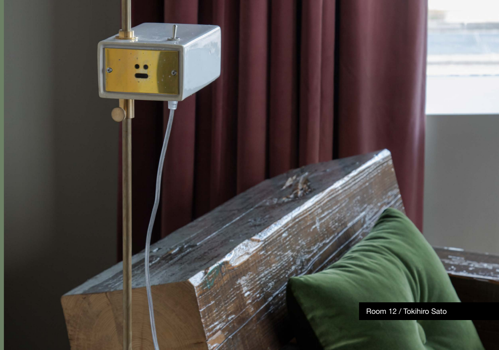
Room 12 / Tokihiro Sato

Please view the shared Google Drive or www.hotelpietheneek.nl for more imagery.