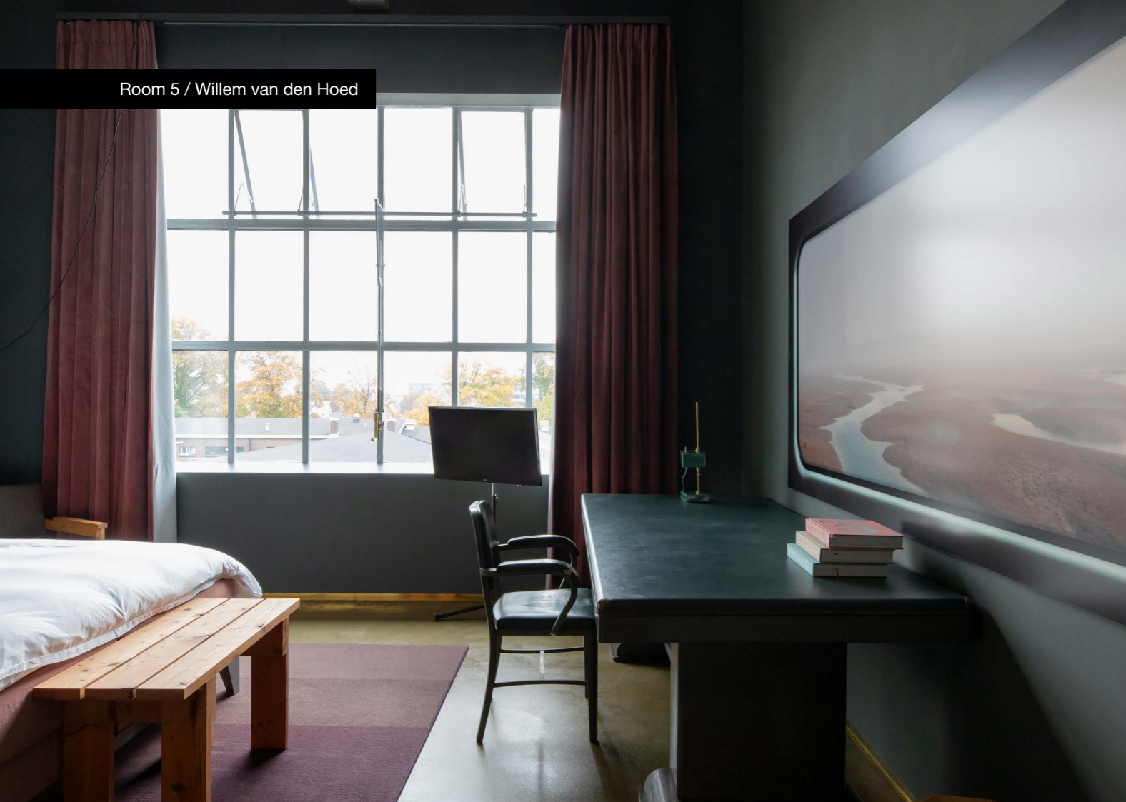
Room 5 / Willem van den Hoed