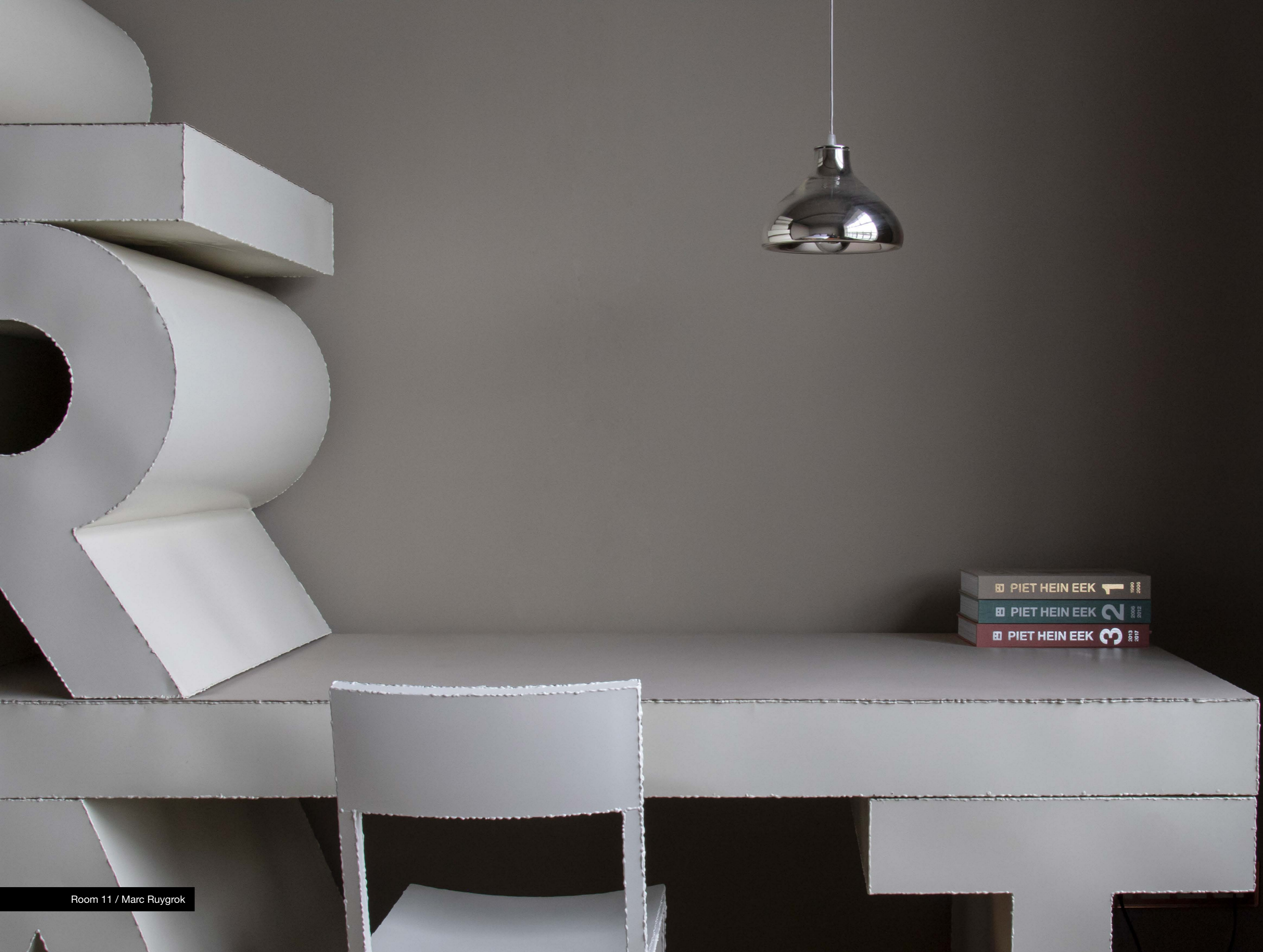
Room 11 / Marc Ruygrok