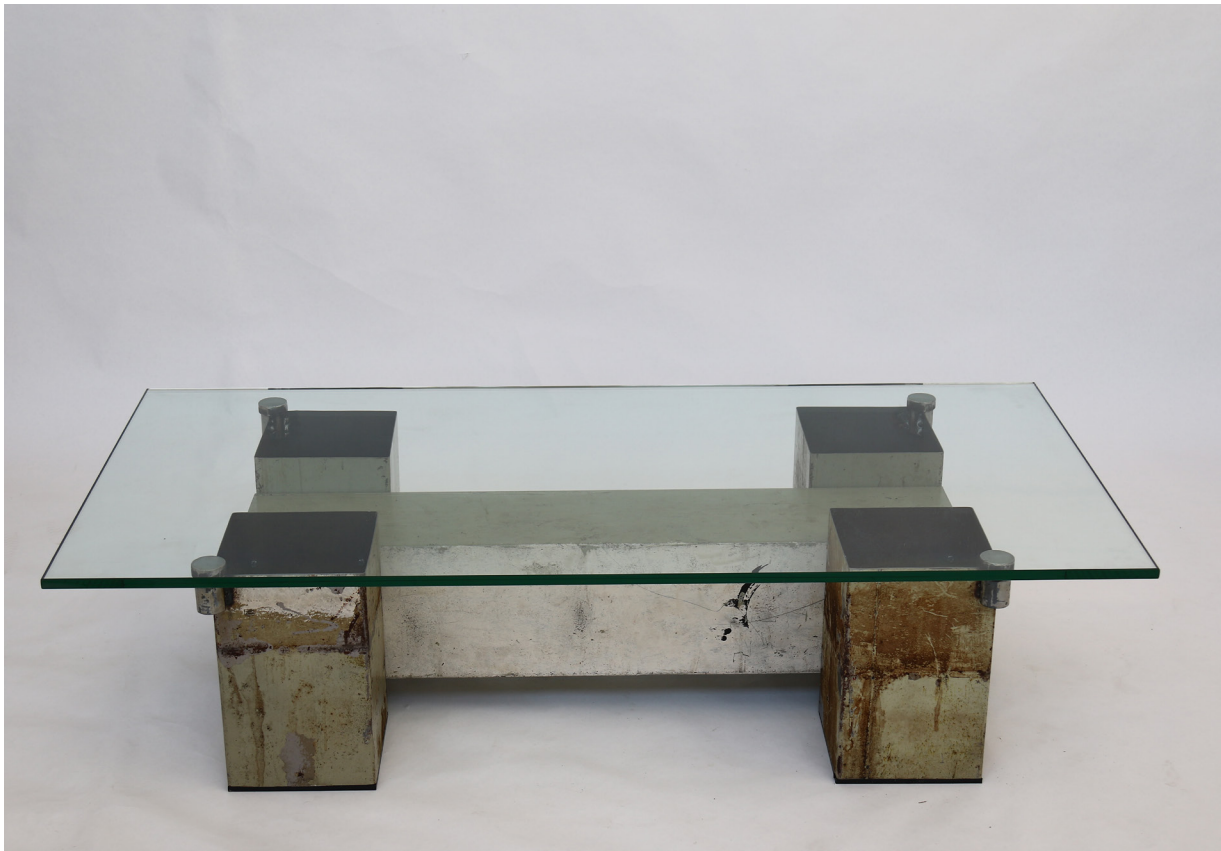
TABLE TRAM PLATFORM FURNITURE

We always elaborate on what we have made before, and sometimes a new element is added to our shape and design vocabulary. As such, we made Tramkadetafels (Tram platform tables). These are made from tubing, just like the RAG furniture. An important difference is that the Tram platform used square tubing. These tubes were used to house the Jacob's Ladder trays with which animal feed was transported. The robust square tubes are even stronger than the round RAG tubing. The tables are reminiscent of the architecture they originate from.