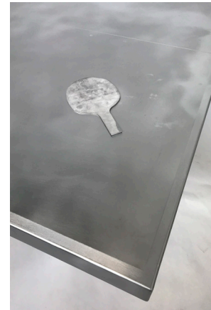
TABLE TENNIS TABLE

This aluminum table tennis table is customized for an American client.