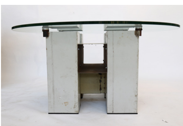
TABLE TRAM PLATFORM FURNITURE