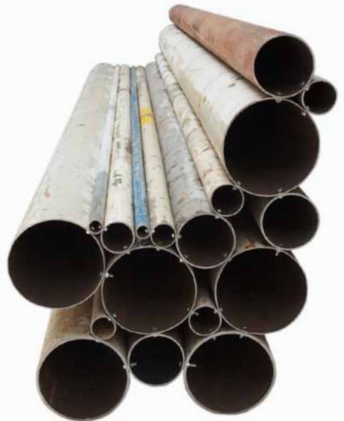
Pipe bench 3

The pipe armchair is made of old pipes that were salvaged from the building we bought and renovated last year. In spite of the huge number of pipes we discarded, we also managed to save quite a large quantity. The first pipe piece we produced was the pipe bar for the restaurant. This was followed by the design for this armchair, bar chairs, small bar tables and, finally (for now at least), the pipe bench (although we have plenty of other ideas for other objects). The models are numbered consecutively by name (i.e. armchair no. 1, bench no. 2, and so on).