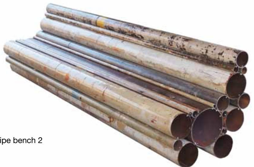
Pipe bench 2