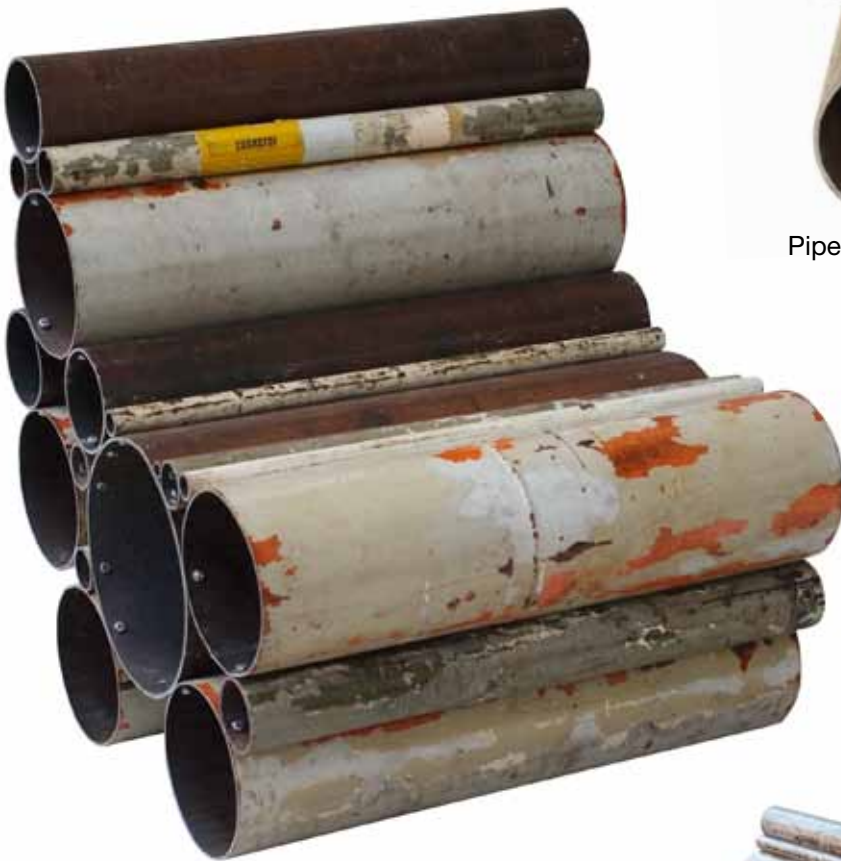
Pipe armchair 1